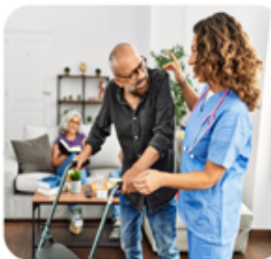
Special care homes, alcohol & drug treatment centres, homes for senior citizens, boarding homes, private care homes