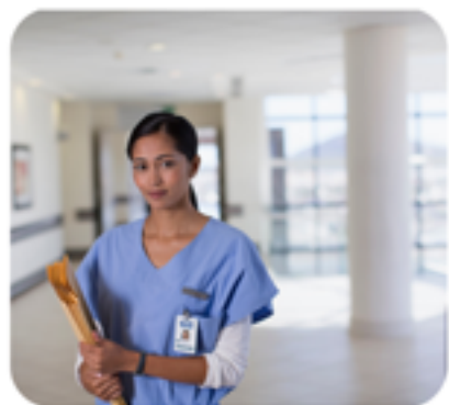
Hospitals, healthcare administration