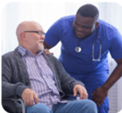
Group care homes, houses for people with disabilities