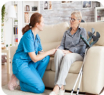
District home care